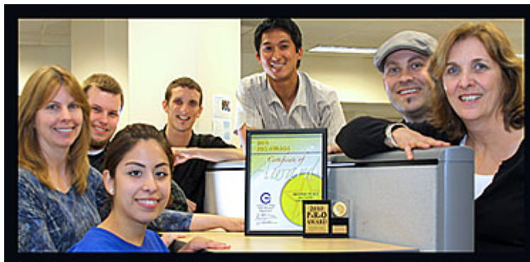
CSM Public Relations and Marketing staff

★ At the Community College Public Relations Organization (CCPRO) CSM's Public Relations and Marketing Department took first place honors in the CCPRO awards for its Career Programs website and a second place in the "Before and After" category for the Bulldog graphic.